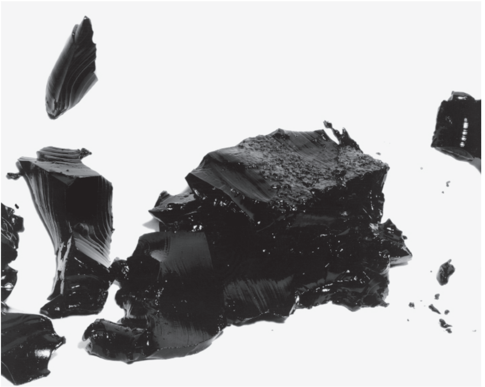
Opposite James Welling B33 (1980) Inkjet print 4 1/8 x 3 1/8 inches