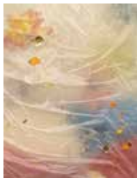
Michelle Bui Envelop #3 , 2022