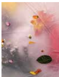
Michelle Bui Envelop #7 , 2022