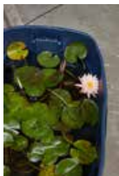
Abbas Akhavan cast for a folly (installation detail), 2019/2022 Courtesy the artist and Catriona Jeffries