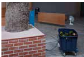
Abbas Akhavan cast for a folly (installation detail), 2019/2022