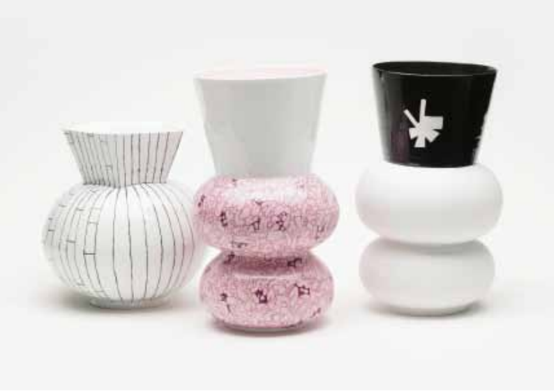
Kalliope II, #7; Kalliope III, #5, #6 (2012) Handpainted and glazed porcelain vessels Private collection Munich; Nymphenburg Porcelain Manufacture, Munich

Awards, grants and residencies include the Art Critics' Prize of Madrid, Spain; the National Endowment of the Arts Award, New York; Arteleku Grant, Basque Ministry of Culture, San Sebastian; the Grand Prize for Visual Art, Germany; the Federal Cross of Merit of Germany for outstanding international achievement; Copan, Artist-in-Residence Award, Sao Paulo, Brazil; the Nietzsche Grant, Artist-in-Residence, Sils-Maria, Switzerland; Guest of Honour Residency at the German Academy, Villa Massimo in Rome and the Nirox Foundation residency award, Johannesburg, South Africa. His work has been widely published internationally. Among others, monographs include: Cantos , Amsterdam, 1997; Fragments , Karlsruhe, 1998; Cantos y otras mentiras / Songs and other lies , Valencia, 1999; CrossMapping , Beijing, 2000; Architecture-Sculpture , The Hague, 2001; La robe des choses , Ghent, 2002; Suave Loucura-Gentle Madness , Sao Paulo, 2005; Roma-Sao Paulo Drawings and Copan Diary , Sao Paulo, 2007; Metaphysical Landscape , Basel, 2007; Discontinuity, Paradox and Precision , Birmingham/Bonn, 2008; Lemke , Berlin, 2011; Seeds & Tracks and Folded Spirits , Cologne, 2012; Kalliope , Munich/ Cologne, 2013.