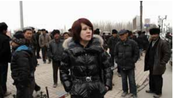
Sameer Farooq The Silk Road of Pop (2013) Film still

Leach's work has been presented at the 5th Auckland Triennial and SCAPE Biennial of Public Art. In 2012 she was Taranaki Artist in Residence with the Govett-Brewster Art Gallery in New Plymouth and in 2008 was an International Artist in Residence at the National Sculpture Factory in Cork City, Ireland.