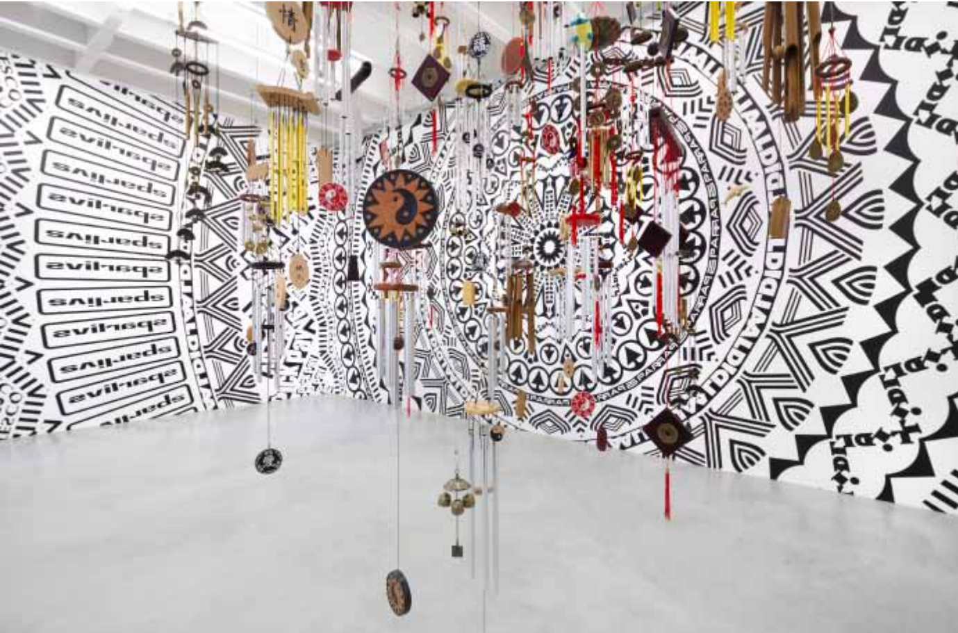
Gunilla Klingberg Installation view; Trancentrance (2009–2014) and Repeat Pattern (2002–2014)

At the gallery and the Yaletown-Roundhouse Station, two murals of seemingly quasi-oriental pattern appear to evoke cosmic mandalas, transforming the individual spaces and enveloping the viewer in light and colour, shifting patterns and reflections. Klingberg's work surrounds us. We are seduced, made part of a special atmosphere, immersed within the work rather than just looking at it. Her interest in using patterns and movement to manipulate our seeing, to influence our state of consciousness and our sensory impressions, has links with Op Art and the psychedelic movement of the late sixties, appropriate touchstones in the recent history of the counter culture in this part of the world.