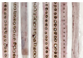
Gabrielle L'Hirondelle Hill Process image for M**** , 2023