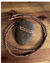
Sesemiya Stone Necklace , 2017