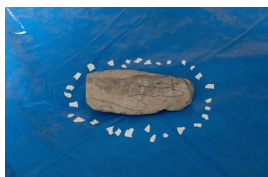
Dionne Lee Ratios (detail) , 2023