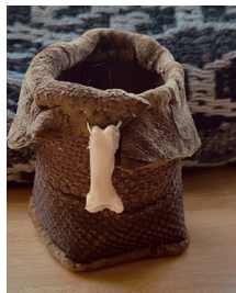
Sesemiya Fish Skin, Cougar Bone, and Fungus Fibre Container , 2020